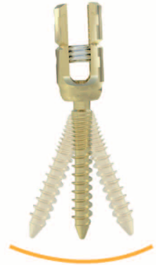
万向可折断椎弓根钉 Boroken-type Cardan Screw